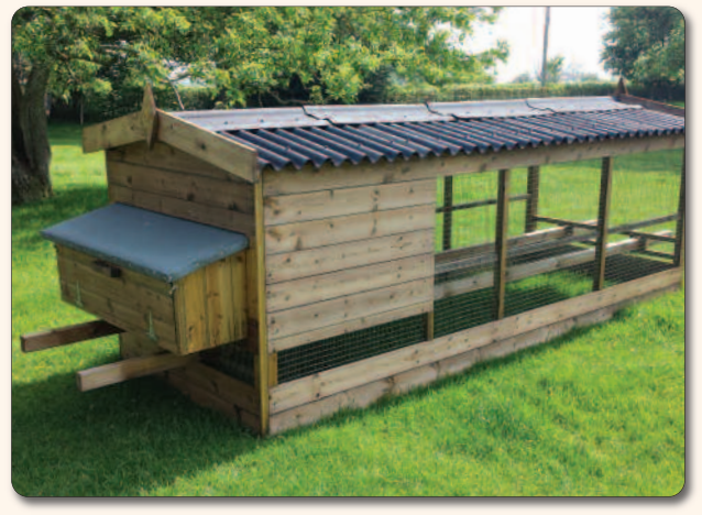
Mini Thicket with 3' extended run

The smaller size of our best-selling 'Thicket' poultry house (opposite). The Mini Thicket is suitable for up to 8 standard birds or 12 bantams. It has two boards around the base to give protection from the winds and also deters foxes and other predators from digging. Removable carrying handles run throughout the building and double up as daytime perches. The whole building is roofed with black corrugated onduline.