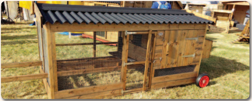
Mini Thicket with doors open